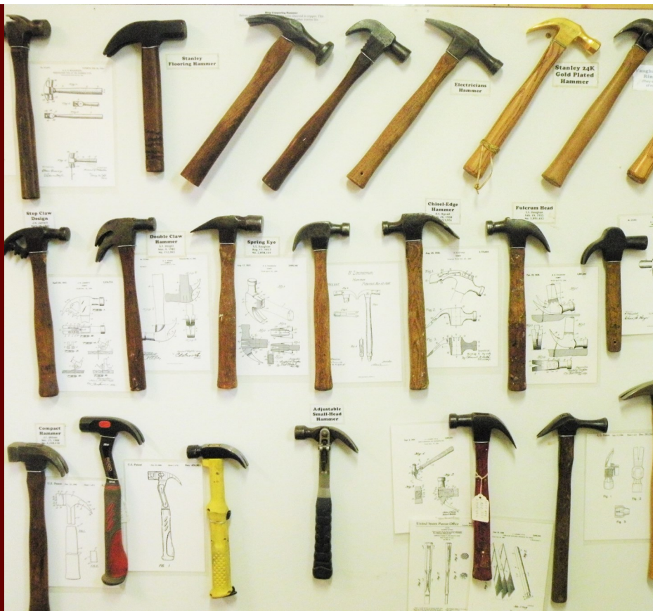
Claw hammer display in the Materials Room

- Collections Management Grant from Museums Alaska (Round 2, 16/17) - will be used to continue Ashleigh's collection clean up project