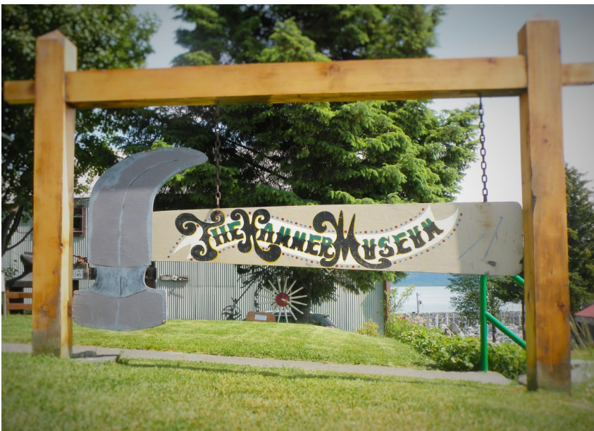
Hammer Museum Annual Newsletter